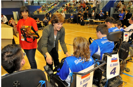
Congratulations by the Council of Barberà del Vallès