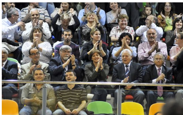
Before the match Presentation & National anthems