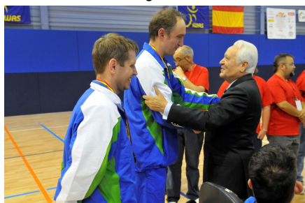
Congratulations by the Barcelonan consul of Slovenia