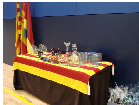
Congratulations by the General Secretary of the FEDDF and thanks to the Officials: Jury Members, Referees and Classifiers