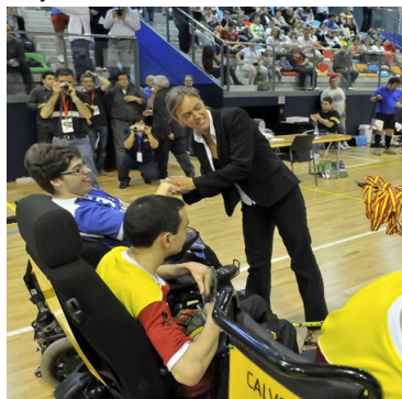
Congratulations by the IWAS Technical Delegate