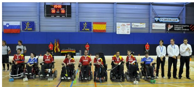
National Team Spain