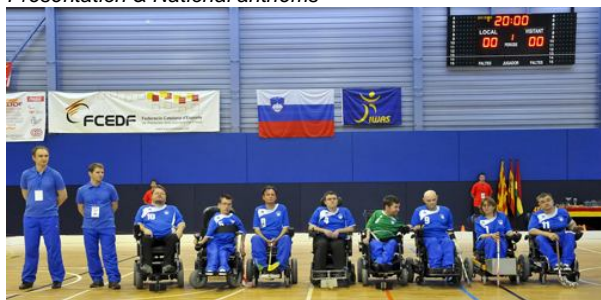
National Team Slovenia