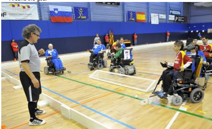
Around the goal